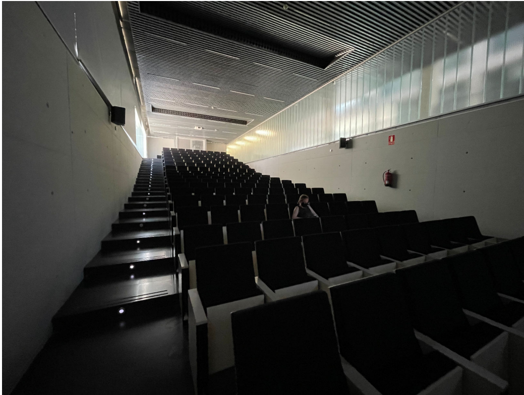
Figure 2. The Auditorium located in a space spanning 2 floors.

Another type of logfiles, the evaluation logfiles, are used for evaluation at the competition and do not contain any position reference (no 'POSI' header). These logfiles contain measurements were taken following the same procedure used in the training and validation logfiles. There is no guarantee that the users and/or phones involved in the evaluation participated in the training and validation data collection. The evaluation of the competitor's algorithm will rank its performance according to the metrics previously described in section "Evaluation criterion". In Track 3 of the 2021 IPIN competition, we provide 3 evaluation logfile through the EvaalAPI https://evaal.aaloo.org/evaalapi/ . Users have just one trial to submit the position estimates for each evaluation logfile.