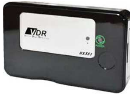
SSEI's VDR Module

Thanks to our sponsor Sugihara SEI (SSEI), the winner can get the prize item, if the winner chose. SSEI provides dedicated modules for PDR and VDR