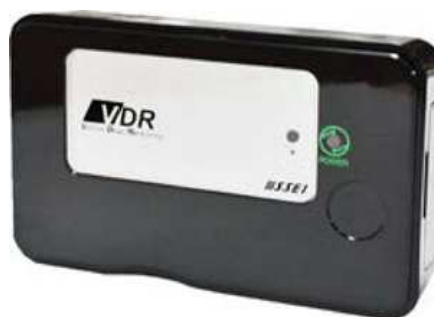
SSEI's VDR Module

Thanks to our sponsor Sugihara (SSEI), the winner can get the prize item, if the winner chose. SSEI provides dedicated modules for PDR and VDR