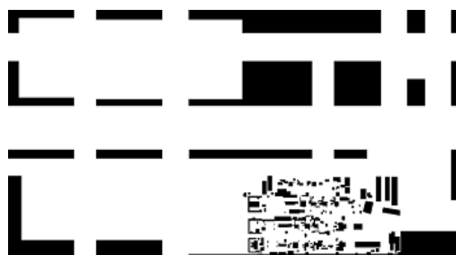
Figure 1 Floor layout of the factory

This year's target environment is a factory in manufacturing industry. This factory is the same factory with the target field of the manufacturing track of xDR Challenge 2019. The target area is expanded in this year. The detailed floor layout is shown in figure 1.